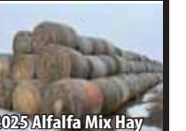
2025 Alfalfa Mix Hay