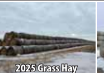
2025 Grass Hay