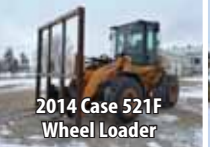
2014 Case 521F Wheel Loader