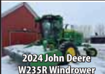
2024 John Deere W235R Windrower

ONLINE ONLY HAY AUCTION BIDDING: Jan. 30th – Feb. 4th