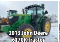
2013 John Deere 6170R Tractor