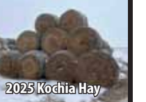
2025 Kochia Hay