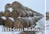
2025 Grass Mix Hay