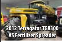
2012 Terragator TG8300 AS Fertilizer Spreader