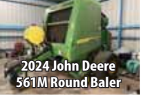
2024 John Deere 561M Round Baler