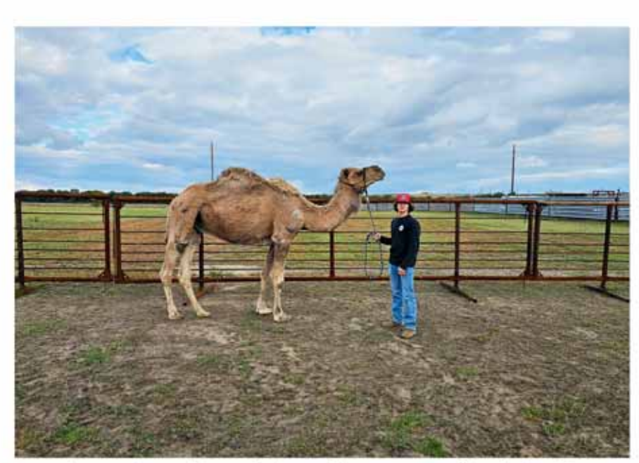
In stock, shipping available!